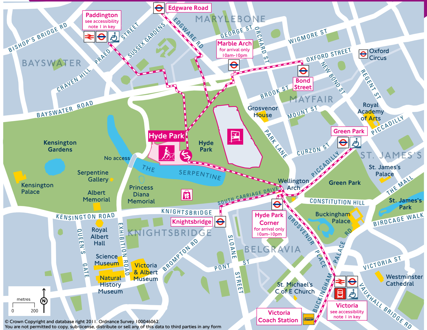
You are not permitted to copy, sub-license, distribute or sell any of this data to third parties in any form

Green Park is the recommended accessible station. See the London 2012 website for more information.