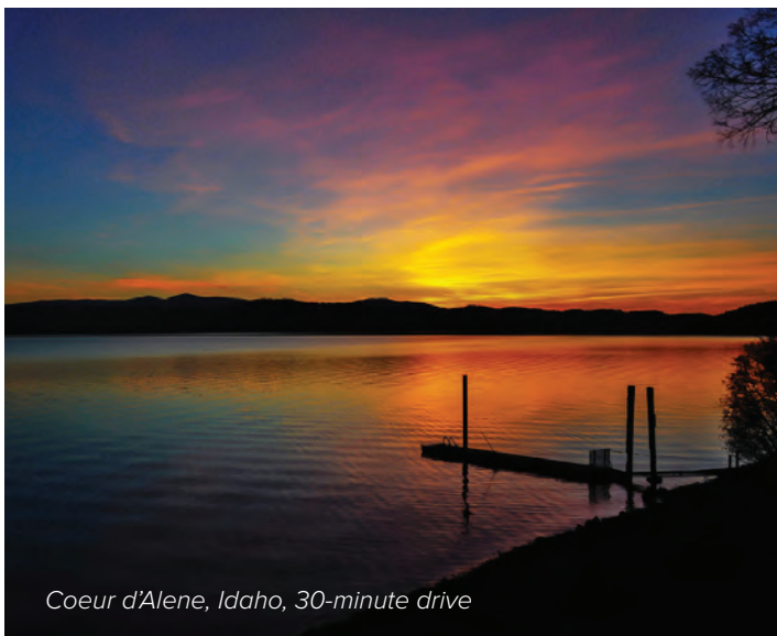
Coeur d'Alene, Idaho, 30-minute drive

The North Cascades are home to beautiful, jagged peaks and mountain views. With more than half a million acres of rugged wilderness, mountainous trails and multiple national forests, the outdoor enthusiast will always have enough to do in this haven.