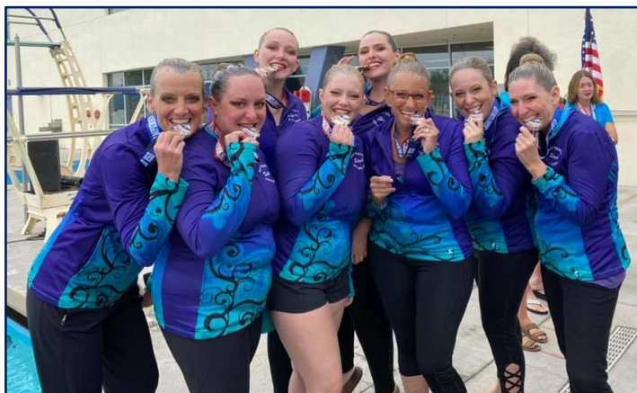
Rocky Mountain Splash Masters bringing home the gold in team routine at the 2021 Masters Championships!

We will be holding a Boys in Sync Camp February 19 th , 20 th & 21 st in Las Vegas. Information will be posted on the USAAS website soon.