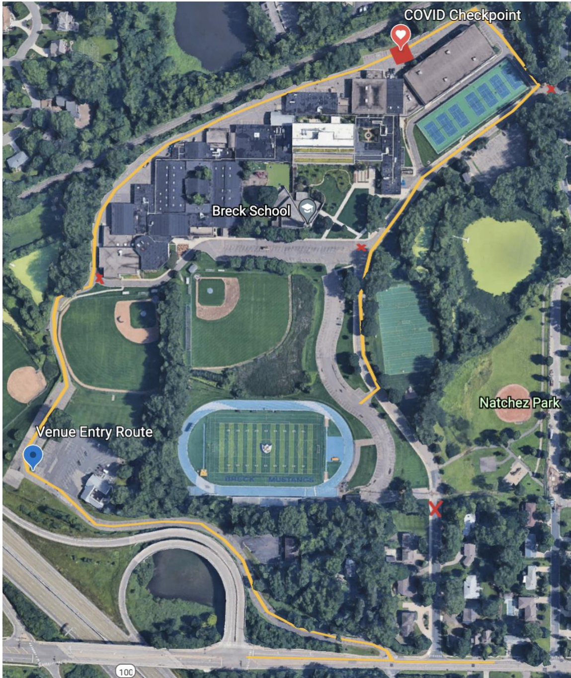
Venue Entry Map