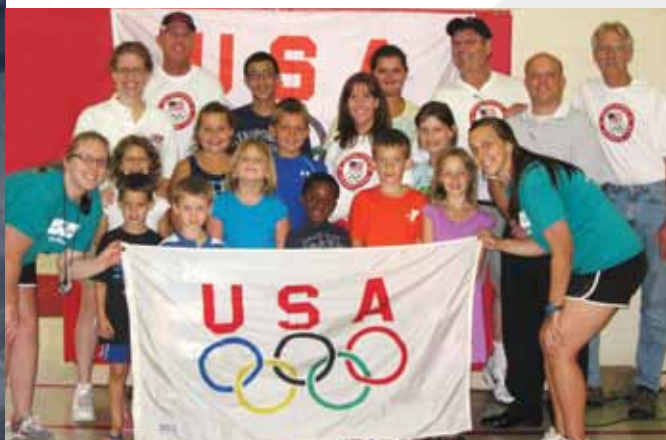
U.S. OLYMPIANS-SOUTHWEST CHAPTER HOST AN OLYMPIC DAY EVENT

in Olympic Day as it is so gratifying to see the faces of the youth participants who are inspired by the Olympians' message. I am working with the United States Olympic Committee (USOC) to provide more turnkey resources to make your participation as easy as possible, and I encourage you to join your fellow Olympians in participating in Olympic Day celebrations in a community near you.