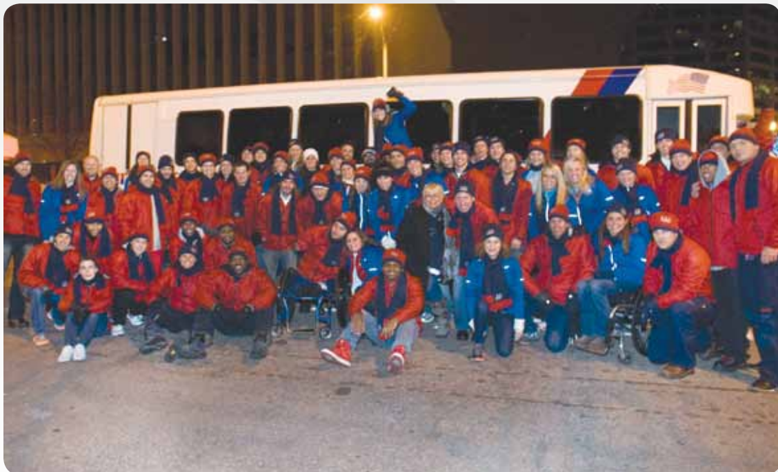
MEMBERS OF TEAM USA POSE FOR A PHOTO AFTER WALKING IN THE FESTIVAL OF LIGHTS PARADE IN COLORADO SPRINGS ON SATURDAY, DECEMBER 3, 2011.