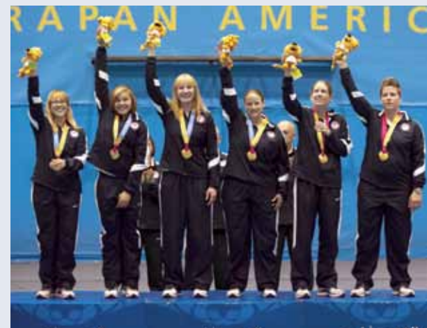
WOMENS GOALBALL PODIUM

All four wheelchair tennis athletes won medals, giving Team USA a podium spot in all four competition events: men's singles, women's singles, men's doubles and women's doubles.