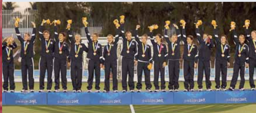
WOMEN'S FIELD HOCKEY TEAM

In water polo, both the men's and women's teams defeated Canada in the finals on the way to winning gold medals and earning spots for the U.S. to compete at the 2012 Olympic Games.