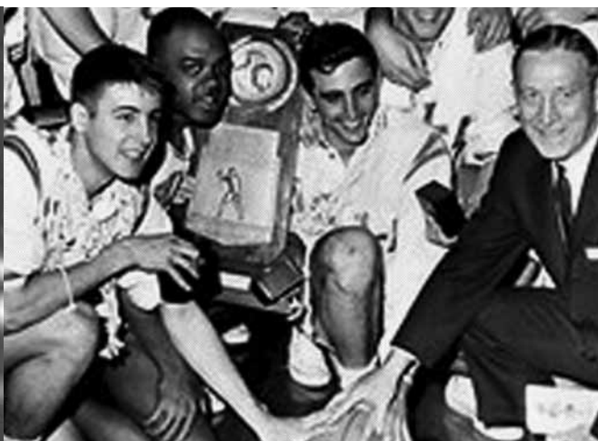
WALT HAZZARD HOLDING THE N.C.A.A. BASKETBALL CHAMPIONSHIP TROPHY IN 1964, THE FIRST NATIONAL TITLE FOR JOHN WOODEN, RIGHT.