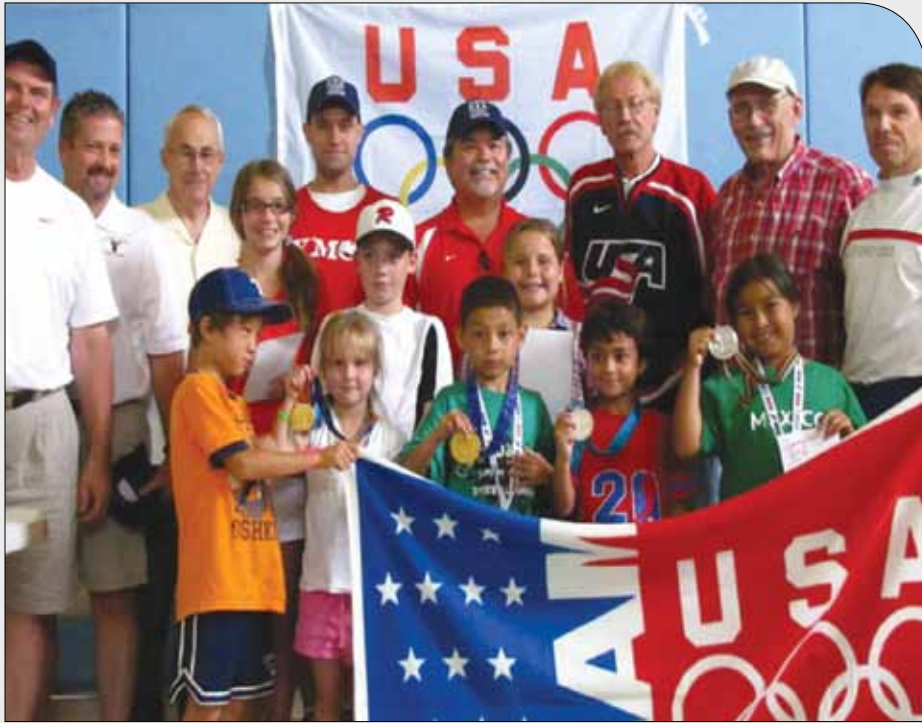
Rockwall, Texas: 2012 Olympic Day liaison and Olympian Sammy Walker and local Olympians celebrate Olympic Day at the YMCA of Rockwall.