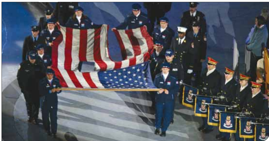
Members of the New York Police and Fire departments watch as American athletes hold the American flag found at ‘Ground Zero’ at the World Trade Center during the Opening Ceremony of the Salt Lake City 2002 Olympic Winter Games.