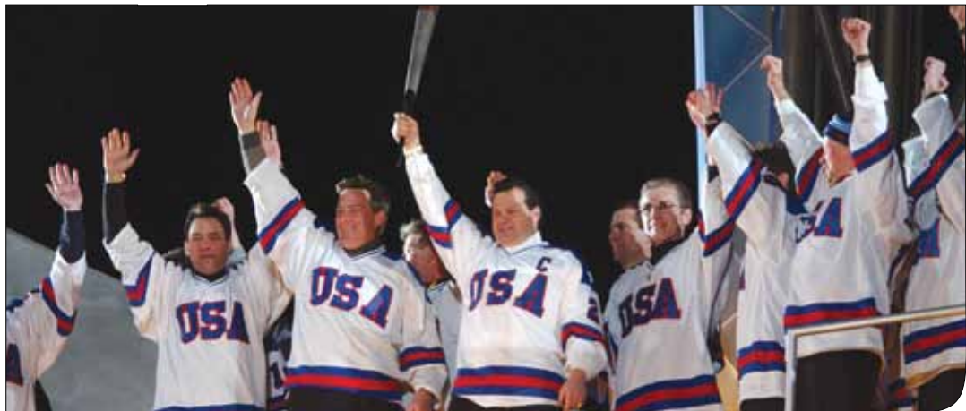
Captain Mike Eruzione and other members of the 1980 gold medal-winning U.S. men's hockey team hold up the torch before lighting the Olympic flame at the Opening Ceremony of the Salt Lake City 2002 Olympic Winter Games at the Rice-Eccles Olympic Stadium

"In Nagano, it's a flea market. In Vancouver, it's a fitness center. Italy, I don't know what it is. It could be a