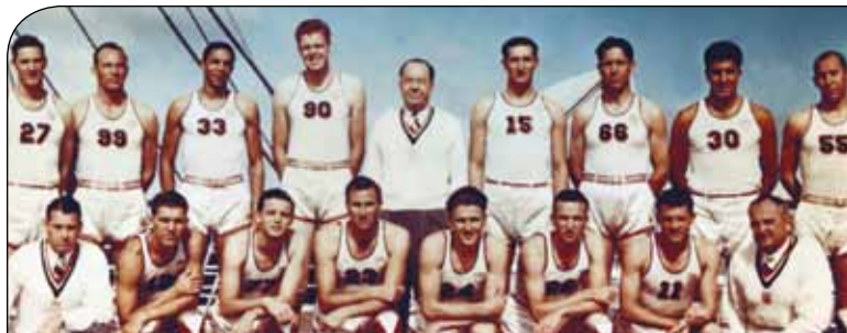
1948 U.S. Olympic team

Both of A&M's NCAA championship games were played in New York's Madison Square Garden, and it was the NYC-based Knicks, of the fledgling Basketball Association of America that became the NBA were among his most ardent suitors.