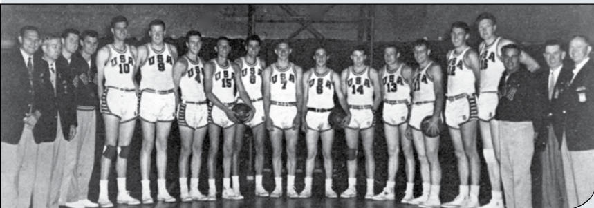
1952 Olympic team