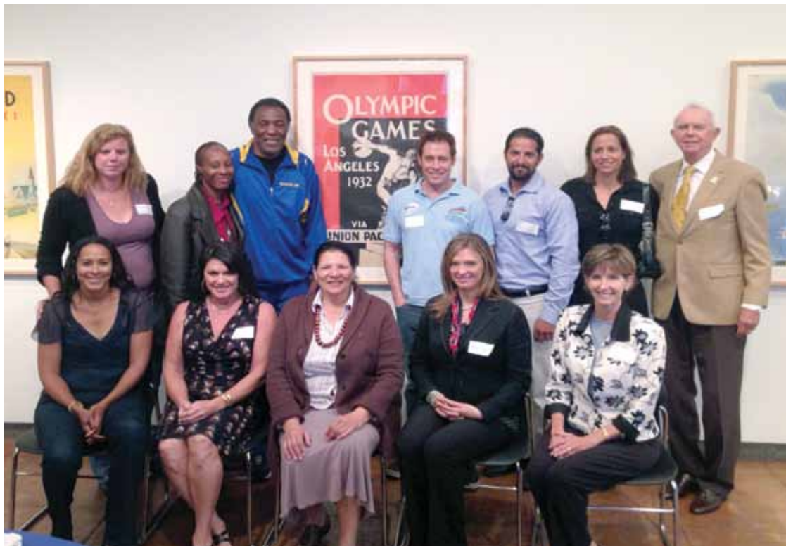
A group shot of a few of our Olympians from our end of the year celebration.

District (LAUSD). As the school year comes to an end, we’d like to reflect on all of the amazing accomplishments Ready, Set, Gold! (RSG!) has reached this year. More important than our achievements as a program are the achievements our participating schools and students made individually during the 2012-2013 school year. Although we use the California-mandated Fitnessgram test as a benchmark for our program’s success, the 15,000 students we have impacted will have much