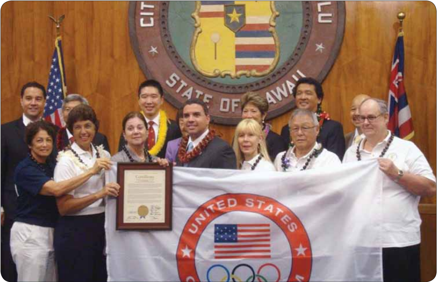
PHOTO Highlights of chapter and Olympian events.