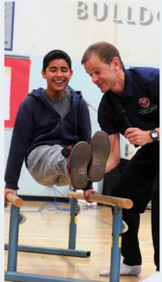
RSG! Chairman, Peter Vidmar (gymnastics, 1980, '84)