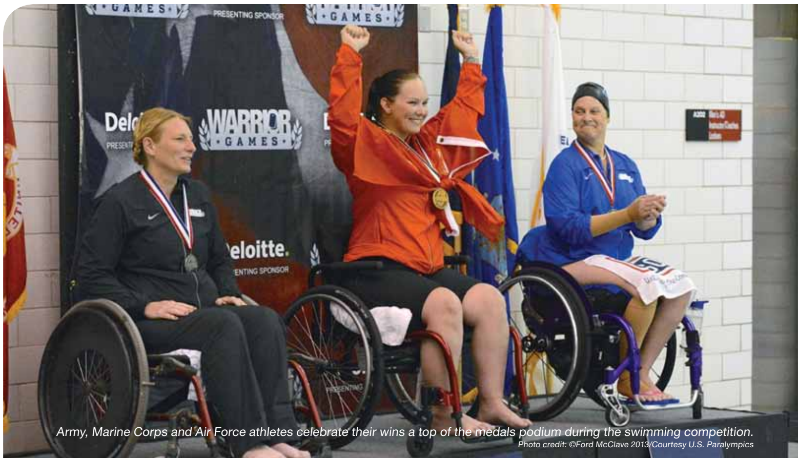
Army, Marine Corps and Air Force athletes celebrate their wins atop the medals podium during the swimming competition.