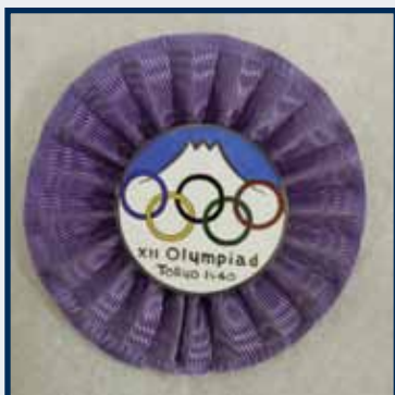
1940 Olympic Games Japanese Athletic Federation Badge