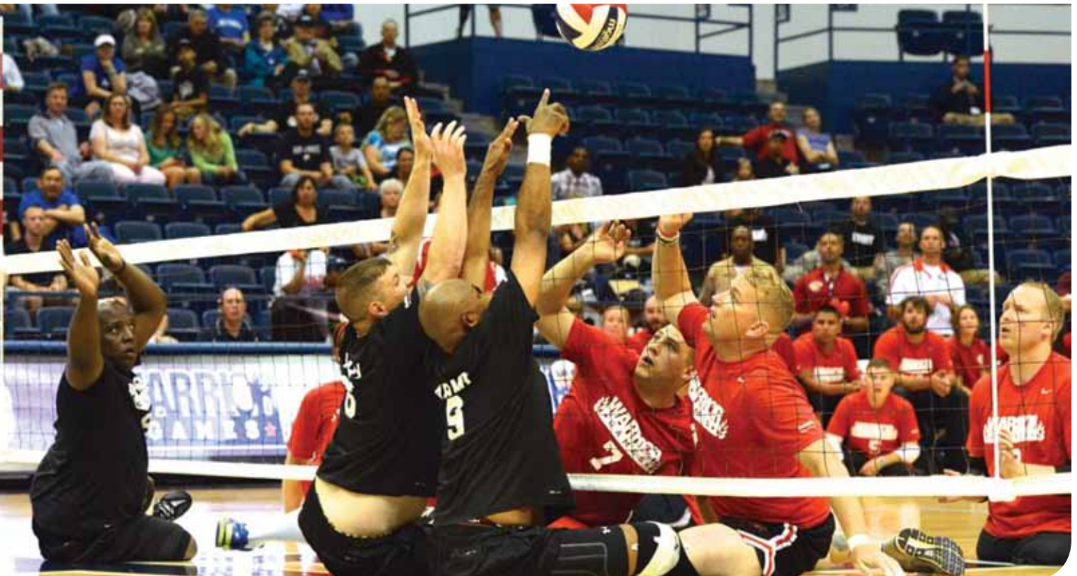
The Army and Marine Corps teams face off in sitting volleyball competition during the 2013 Warrior Games presented by Deloitte.

Colorado Springs, you did yourself proud!