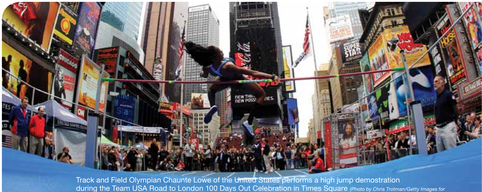
Track and Field Olympian Chaunte Lowe of the United States performs a high jump demonstration during the Team USA Road to London 100 Days Out Celebration in Times Square