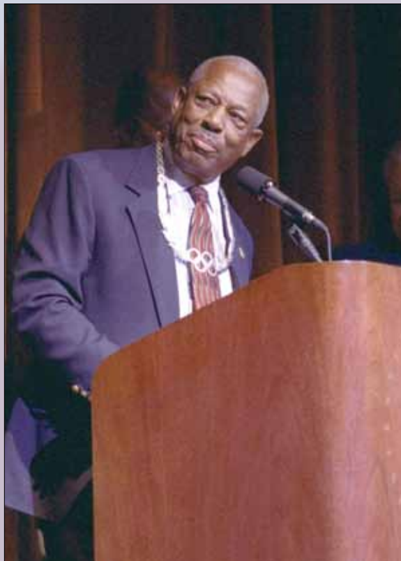
Dr. LeRoy T. Walker

emeritus at North Carolina Central University and president emeritus of the United States Olympic Committee, was born June 14, 1918, in Atlanta, Ga. His career spanned more than 60 years as an educator, coach and mentor. He also led many national and international organizations in sports and education, and was a member of numerous sports halls of fame.