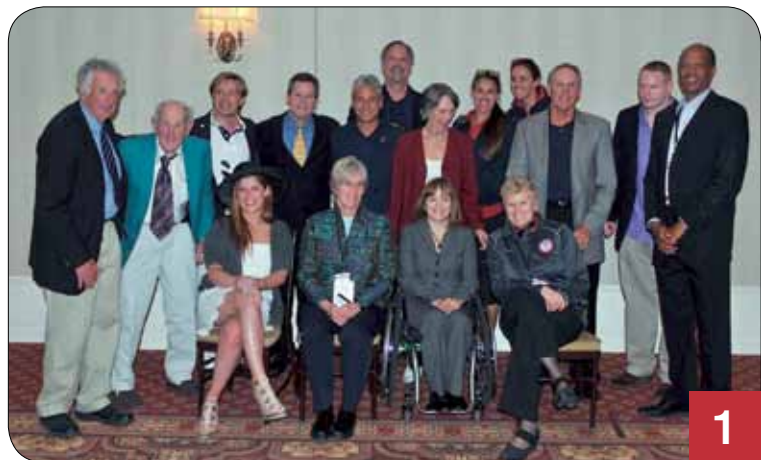
PHOTO Highlights of chapter and Olympian events.