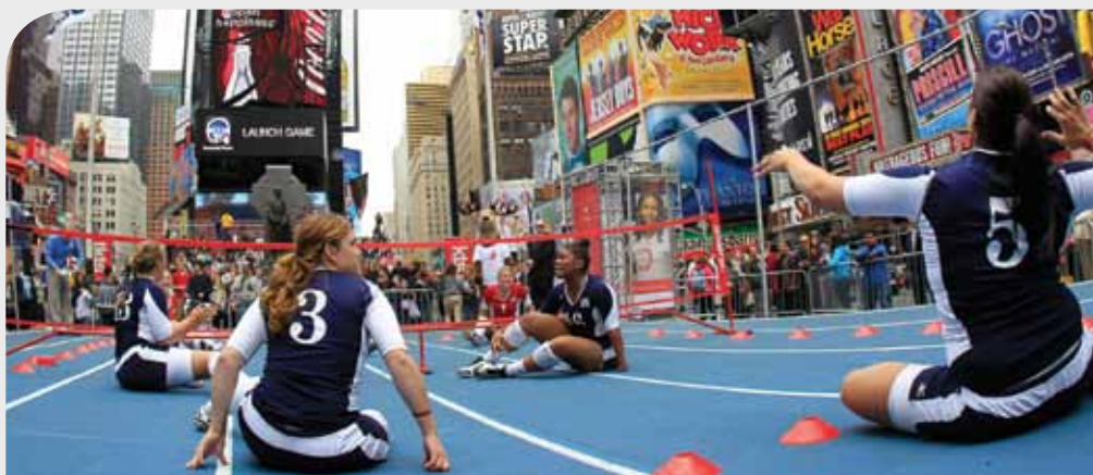
Paralympic athletes perform a sitting volleyball demonstration during the Team USA Road to London 100 Days Out Celebration in Times Square on April 18, 2012 in New York City.