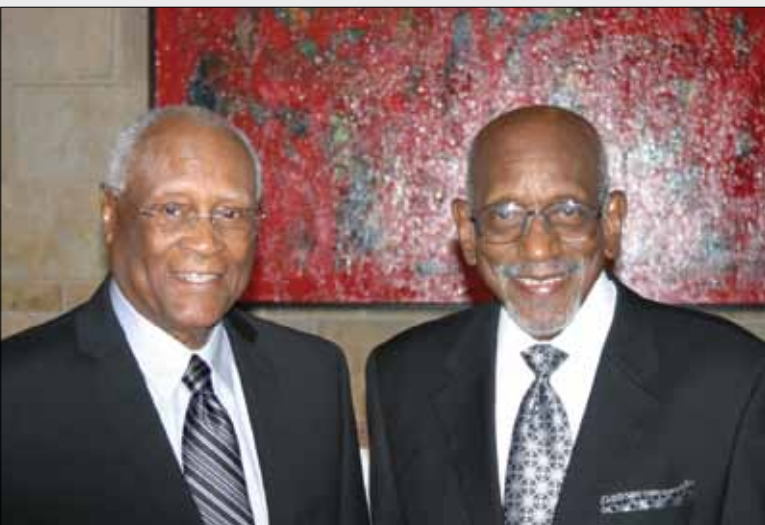
Herb Douglas and Harrison Dillard

Harrison Dillard and Herb Douglas are humble, modest gentlemen with