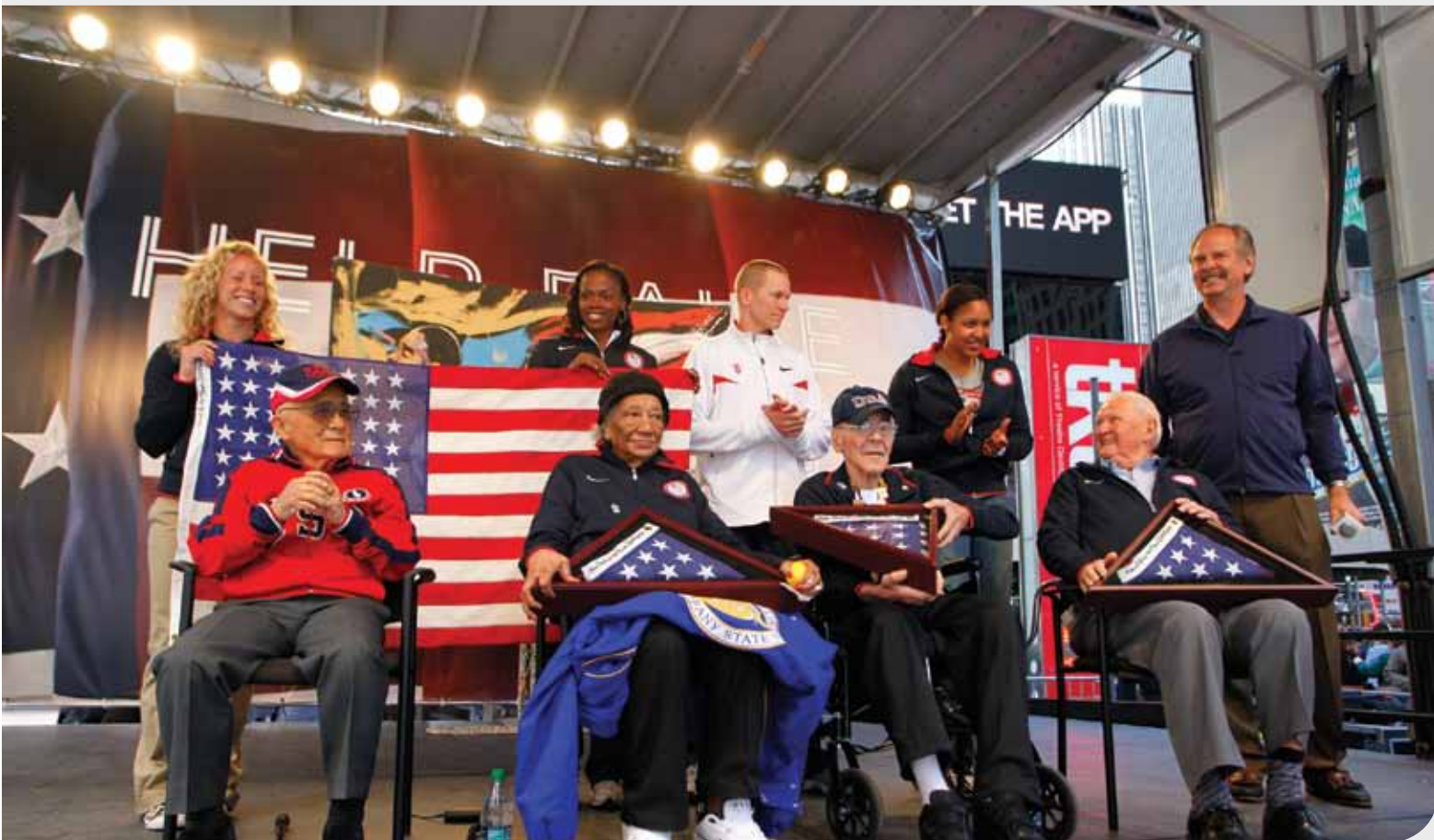
American flags are presented to 1948 Olympic athletes Dr. Sammy Lee, Alice Coachman, Mal Whitfield and Ray Lumpp during the Team USA Road to London 100 Days Out Celebration in Times Square on April 18, 2012 in New York City.

American athletes, and many of them will have to wait until the bitter end to find out if they will make the team. The month of June featured Olympic Trials in many