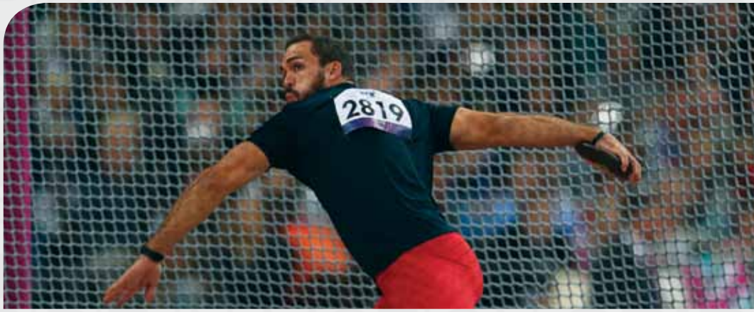
Jeremy Campbell of the United States competes in the Men's Discus Throw

"It means a lot," Long told TeamUSA.org. "It's such an honor, and you know, I truly just love what I do. I hope kids with or without a disability look at me as a good role model and want to get out and do what I'm doing and get involved in sports and everything."