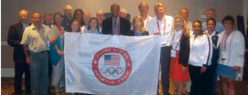
The United States Olympians Association Board members at this year's Annual Meeting and U.S. Olympic & Paralympic Assembly, September 20-21, 2012 in Colorado Springs, Colo.

Another successful activity was one spearheaded by Olympian Micki King. The Kids4Trees program brought young kids and Olympians together in the forests around the nation to enjoy nature, plant young saplings and talk about the benefits of healthy living. Many Olympians participated, but two went above and beyond – Kevin Young and Mel Pender. Thank you all for your efforts. The program is a wild success and praised by the U.S. Forest Service.