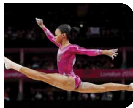
Gabrielle Douglas of the United States competes on the balance beam in the Artistic Gymnastics Women's Individual All-Around