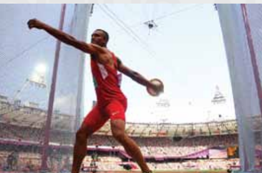
Ashton Eaton of the United States competes during the Men's Decathlon Discus Throw on Day 13 of the London 2012 Olympic Games

Still, the focus of most of the attention in the pool was on Michael Phelps, the eight-time gold medalist from Beijing. Phelps wasn't as dominant as he was four years earlier when he broke Mark Spitz's record of seven gold medals in one Games, but he showed he wasn't about to surrender in what he said were his final Olympic Games. In his opening race, the 400 individual medley, Phelps placed fourth and his teammate Ryan Lochte was the winner. But Phelps