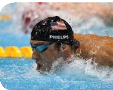
Michael Phelps of the United States competes in the Men's 4x100m Medley Relay Final on Day 8 of the London 2012 Olympic Games