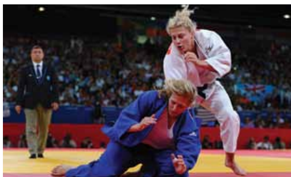
Kayla Harrison of the United States (white) and Gemma Gibbons of Great Britain compete in the Women's -78 kg Judo