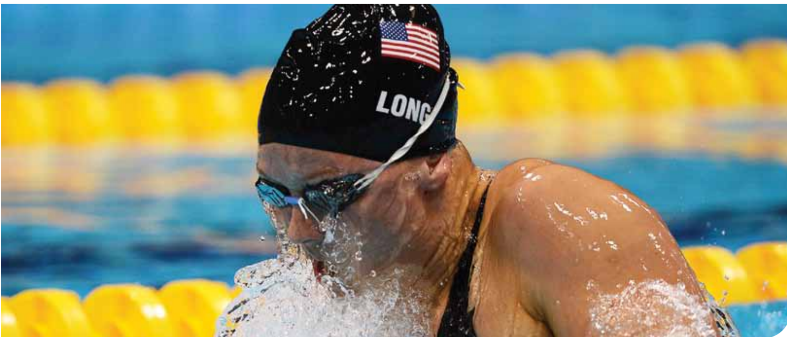
Gold medallist Jessica Long of the United States competes in the Women's 200m Individual Medley -SM8 Final on day 7 of the London 2012 Paralympic Games