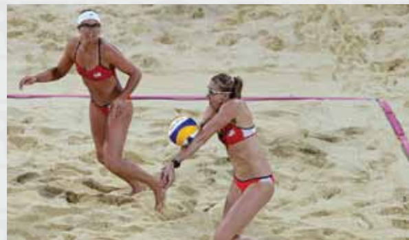
Misty May-Treanor (L) watches as Kerri Walsh Jennings of the United States controls the ball during the Women's Beach Volleyball Gold medal match

chairman Larry Probst said during a news conference at the end of the Games. "There's nothing wrong with that.