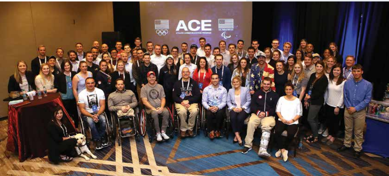
Nearly 90 Team USA Winter Games 2018 athletes attended the ACE Summit

FOR MORE INFORMATION ON ACE, VISIT WWW.TEAMUSA.ORG/ACE OR REACH OUT TO ACE@USOC.ORG .