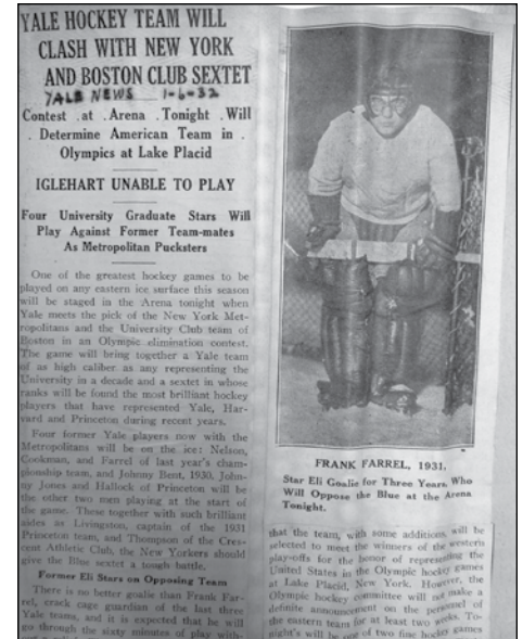
Yale Hockey Team news clipping – Yale News, January 6, 1932.

It was 1932 and the greatest worry was that the ice wouldn't freeze. Lake Placid was experiencing a veritable heatwave with temperatures in the mid-50's in January. The Hudson River had not frozen over for the first time in the 147-year history of the New York state weather bureau. Lake Placid Olympic Organizers feared that there would not be any snow for the Olympic Winter Games. The bobsled run was washed out by heavy rain and ultimately, snow was brought in by train for the Games. Finally, a blizzard hit Lake Placid just days before Opening Ceremony alleviating some concern; but throughout the Games, the warm temperatures in Lake Placid would prove problematic. In the