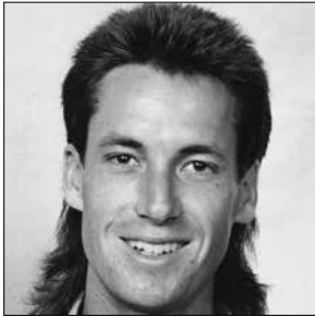
Kenneth "Ken" Flach (Tennis, 1988)

Kenneth "Ken" Flach died on March 12, 2018 at the age of 54.