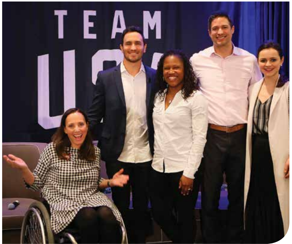
ACE Athlete Alumni Panel shares their story of success (Candace Cable, Jeremy Bloom, Lauryn Williams, Steve Mesler, Sasha Cohen)

Summit 2018 closed with a networking reception connecting Team USA athletes with business professionals and supporters of the USOC and ACE program, along with a final morning of one-on-one sessions and small group discussions on topics such as financial advising, entrepreneurship, navigating the job market, and mapping out the future. The event gave the newly inducted class of 2018 Olympians and Paralympians a host of opportunities to capitalize on, or at least the knowledge in understanding where to go for support and resources. As Olympian and USOC board member, Steve Mesler observed,