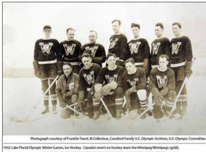
Photograph courtesy of Franklin Farrel, III Collection, Crawford Family U.S. Olympic Archives, U.S. Olympic Committee 1932 Lake Placid Olympic Winter Games, Ice Hockey. Canada's men's ice hockey team the Winnipeg Winniepegs (gold).