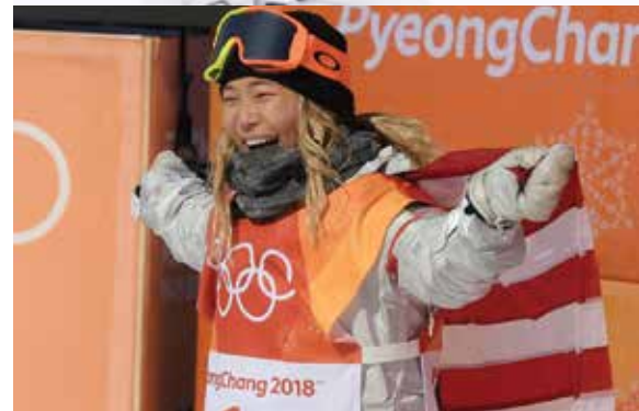
Male Olympic Athlete of the Games – Shaun White, snowboarding