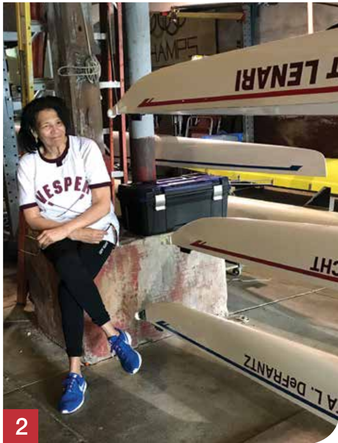
2. Anita DeFrantz (rowing, 1976, 1980) with her namesake boat. This boat is in the Vesper Boat Club in Philadelphia.