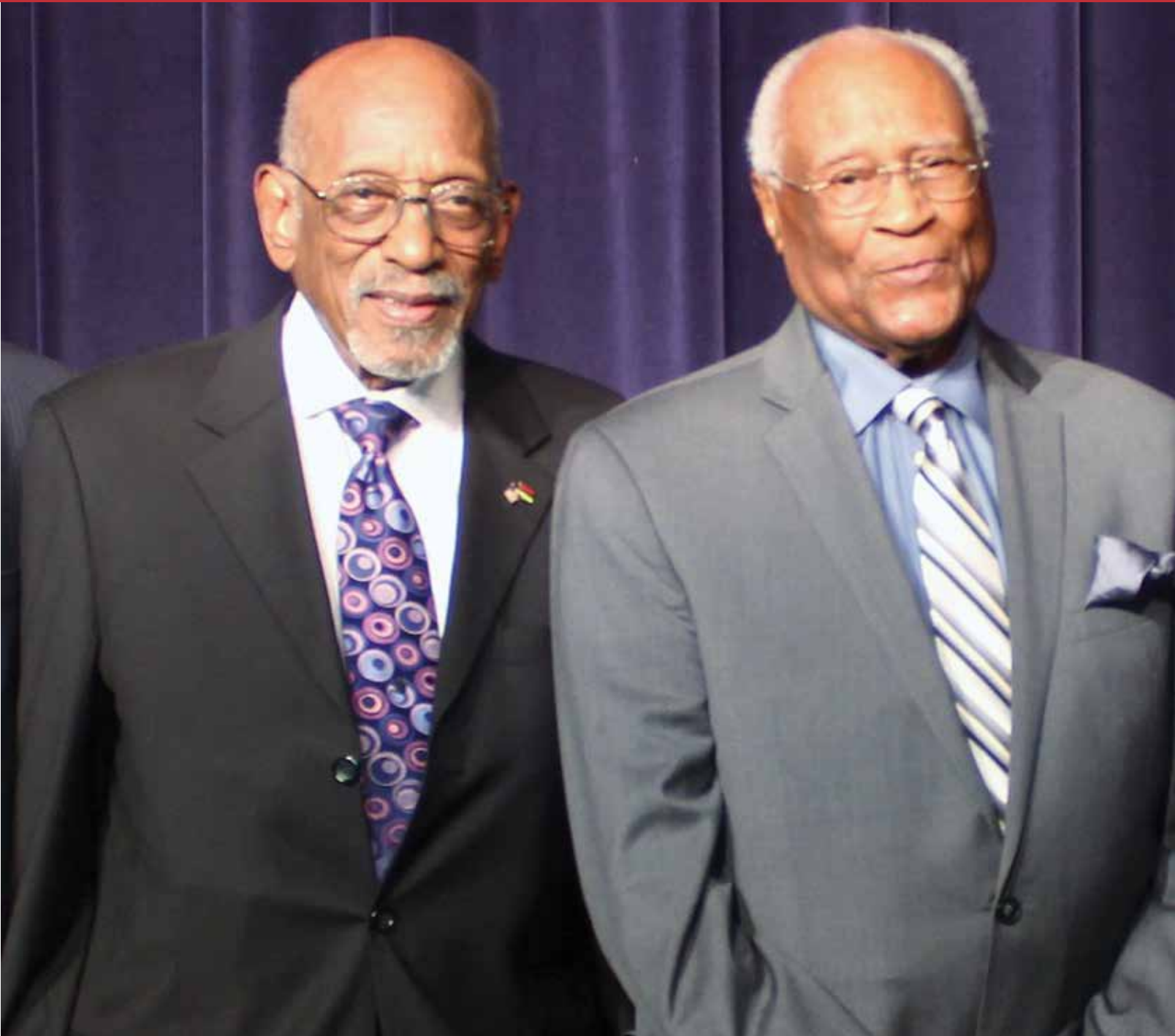
Harrison Dillard and Herbert Douglas