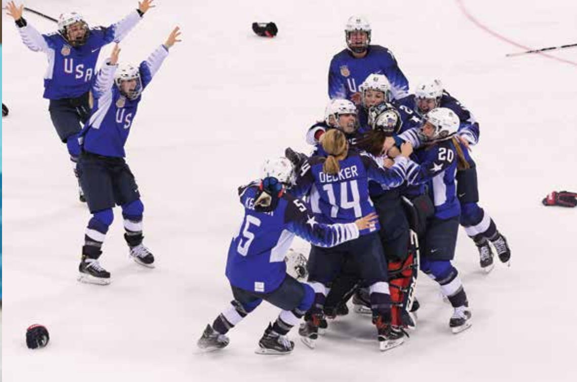
Female Paralympic Athlete of the Games – Oksana Masters, Nordic skiing, Olympic Team of the Games, presented by Dow – U.S. Olympic Women’s Ice Hockey Team