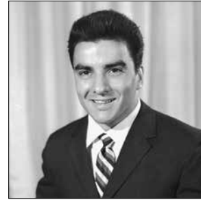
Charles "Chuck" T. Vinci (Weightlifting, 1956, 1960)