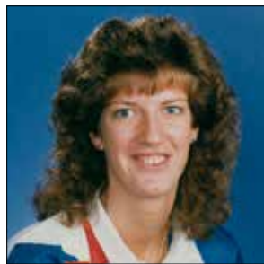
Anne Donovan (Basketball, 1980, 1984, 1988, Coach, 2008)