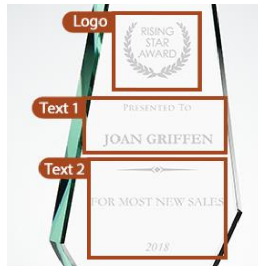
Standard Artwork Template