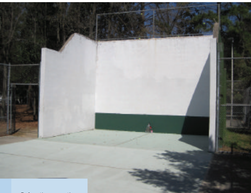
Before the renovations