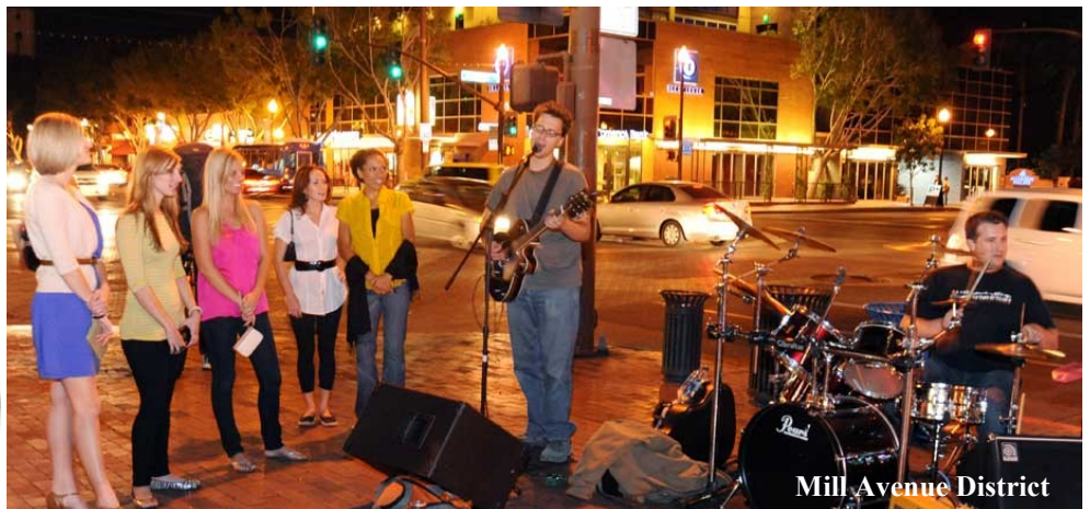
Mill Avenue District