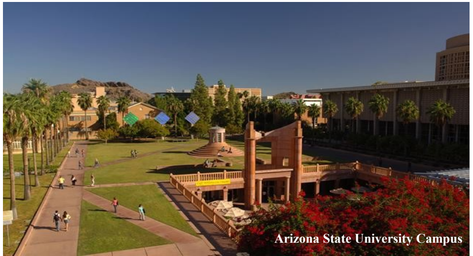
Arizona State University Campus

This National Championship is hosted for USA Racquetball members only. All participants must be current USA Racquetball members on all competition days.