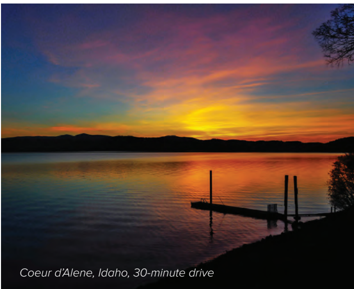
Coeur d'Alene, Idaho, 30-minute drive

The North Cascades are home to beautiful, jagged peaks and mountain views. With more than half a million acres of rugged wilderness, mountainous trails and multiple national forests, the outdoor enthusiast will always have enough to do in this haven.