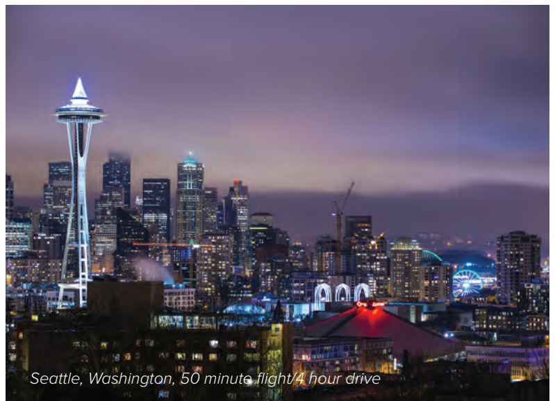
Seattle, Washington, 50 minute flight/4 hour drive