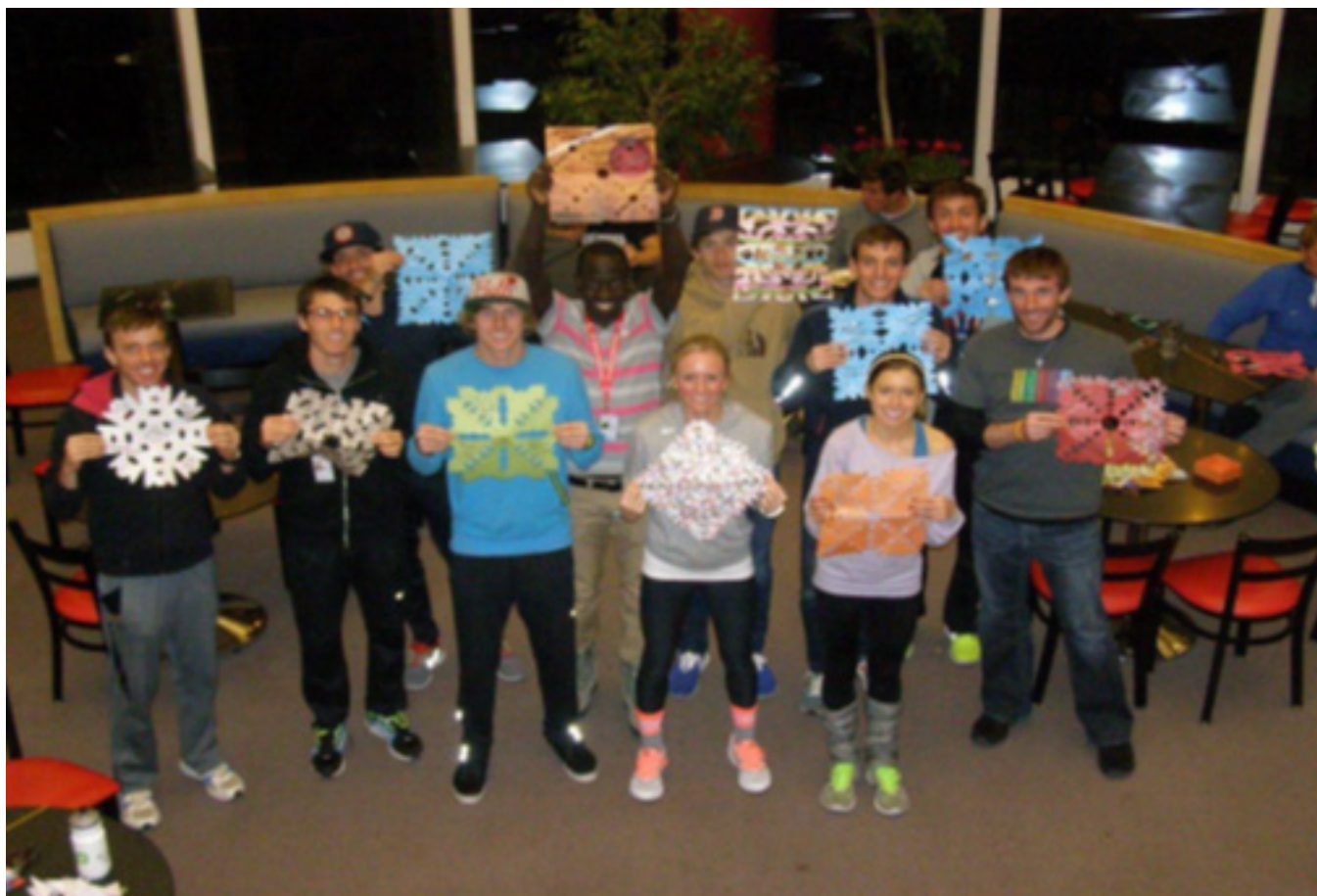
Nike Oregon Track Team at the Colorado Springs Olympic Training Center

Thankfully, Olympian Anthony Ervin – who was training at the CSOTC – was headed to Newtown to do a fundraiser with the town and meet their swim team. The Olympian from Berkley, California, took with him a box full of over 200 personalized snowflakes: mission accomplished! This is a story of the family of sport coming together for the family of a nation!