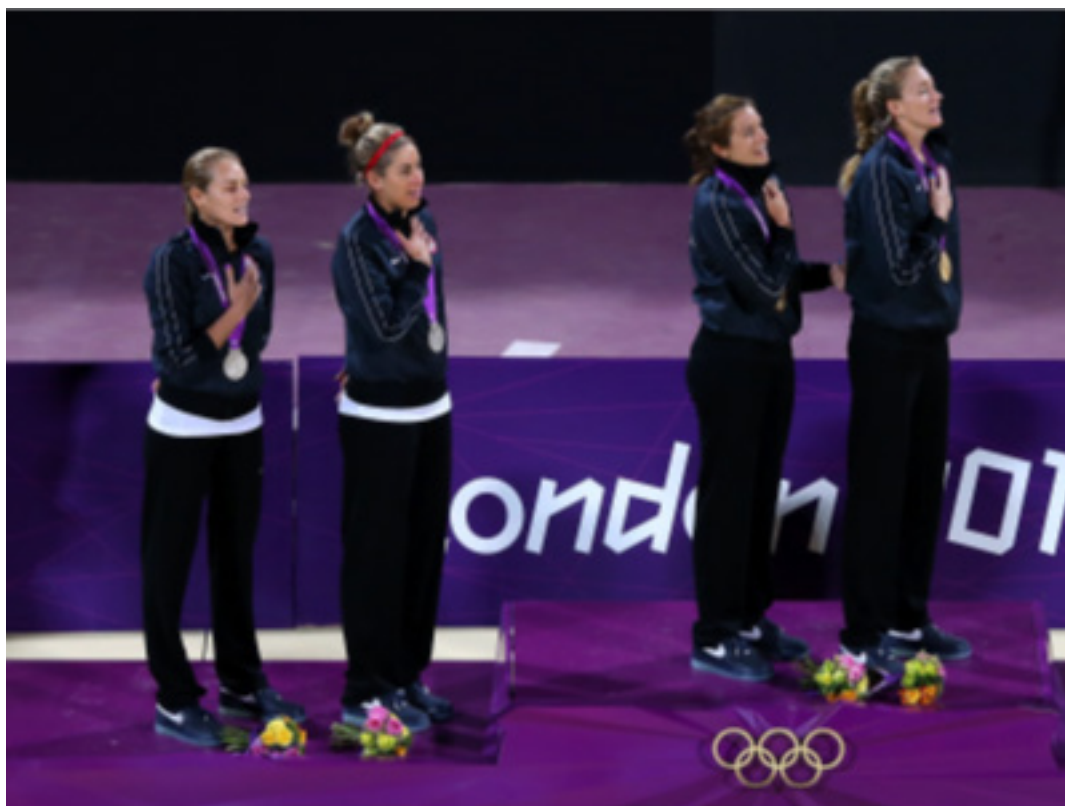
Team USA 1-2, Silver medalists Jennifer Kessy and April Ross and Gold medalists Misty May-Treanor and Kerri Walsh Jennings during the medal ceremony in London.