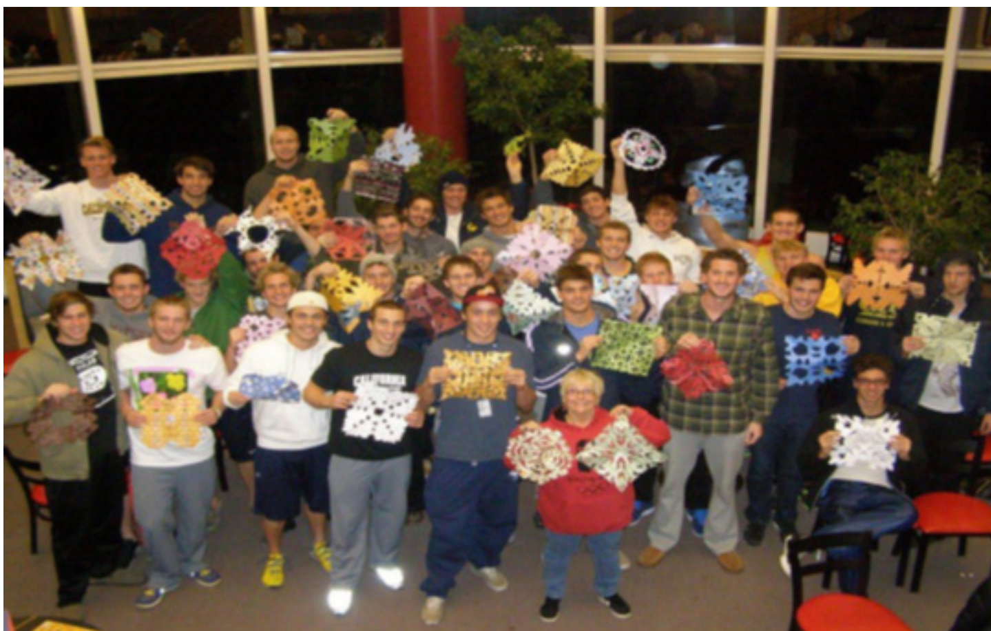
Berkeley Swim Club members at the Colorado Springs Olympic Training Center

After Sept. 11, athletes wrote support letters to firemen, policemen, and first responders. During the wars in Afghanistan and Iraq, athletes sent support letters and gifts to the soldiers. This last tragedy at Sandy Hook Elementary in Newtown, Connecticut was no different. The athletes were affected as the nation was affected. We found an excellent website that outlined how the athletes could get involved and support the victims: making individual cut-out snowflakes for the teachers to hang in the school, so that when the children returned they would know a nation was behind them.