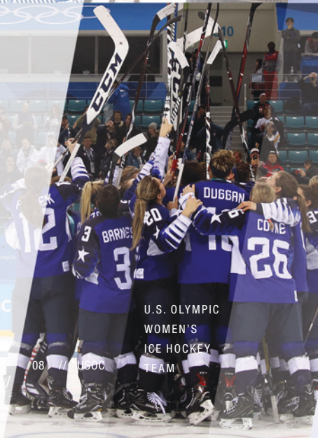
U.S. OLYMPIC WOMEN'S ICE HOCKEY TEAM