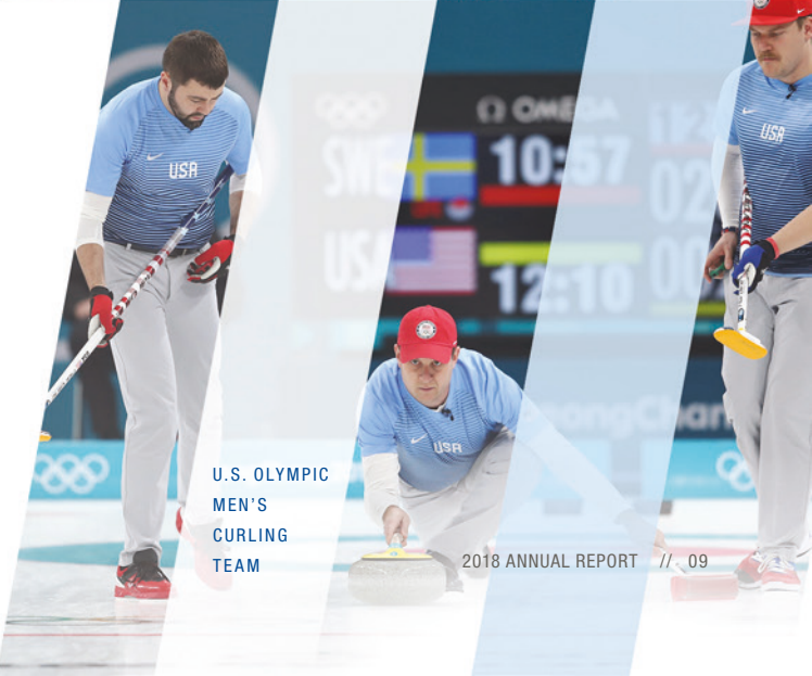
U.S. OLYMPIC MEN'S CURLING TEAM