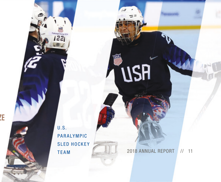
U.S. PARALYMPIC SLED HOCKEY TEAM