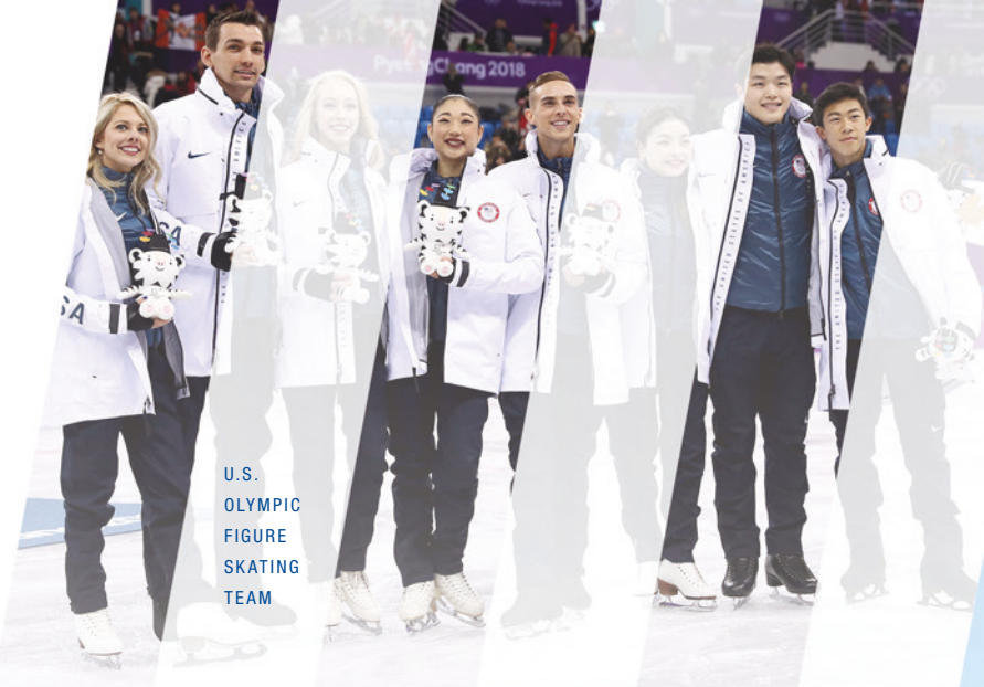
U.S. OLYMPIC FIGURE SKATING TEAM